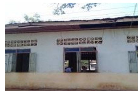
The integrity of the buildings presents severe safety risks to the students and teachers