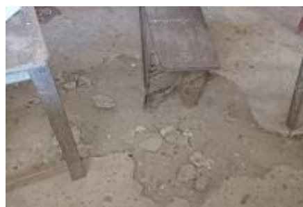
The deteriorating floor in one of the buildings to be replaced