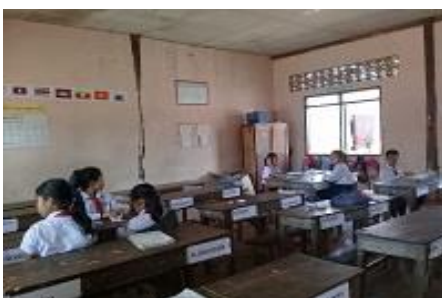
Many of the classrooms have large cracks in the walls and ceilings