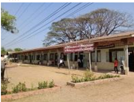
One of the two unsafe school buildings