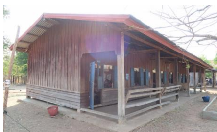
The 3 classroom wooden building, also built by the community in 1990, is still usable and will be used by the nursery students in the future.