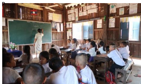
Primary students attending class inside one of the unconducive and unsuitable classrooms.