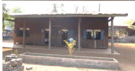
The ramshackle buildings, built by the community in 1985 (top) and in 2000 (bottom), are in a state of great despair and in dire need of replacement.