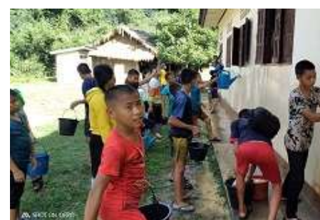
Students cleaning the school