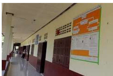
Front of the school building