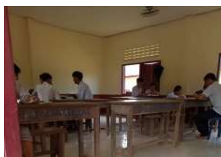
Students in one of the classrooms