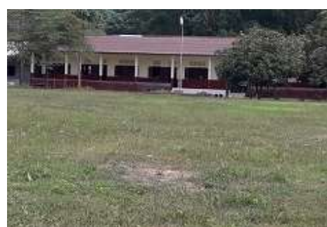
Don Ton Secondary School