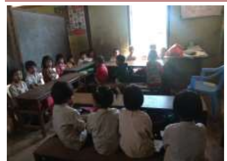
Although it's dilapidated, the building is still being used to conduct classes and becomes dangerous.