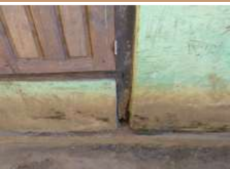
Some of the wooden columns bolted on concrete piers are severely damaged and on verge of collapsing.