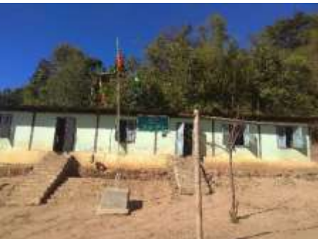
The building is fast deteriorating and in dire need of replacement. It can collapse anytime soon.