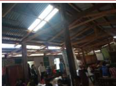
The wooden roof trusses are severely damaged by the rain water.