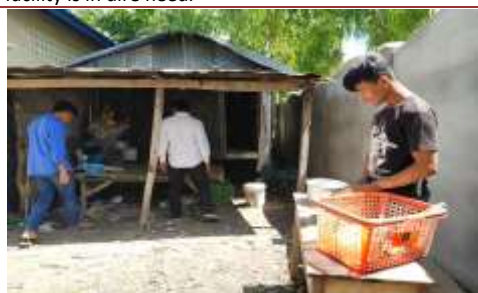
The temporary shelters are mainly made of old and salvaged materials, are rudimentary, and also do not provide enough privacy for the female occupants.