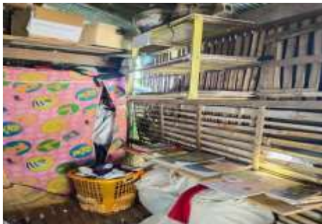
Many students have to resort to living in rotten self-constructed shacks and provision of proper boarding facility is in dire need.