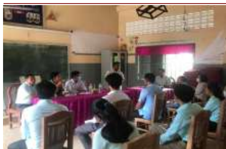
Our field team meeting with school officials to discuss the construction project.