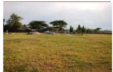
The new boarding house for girls will be constructed in the school ground.