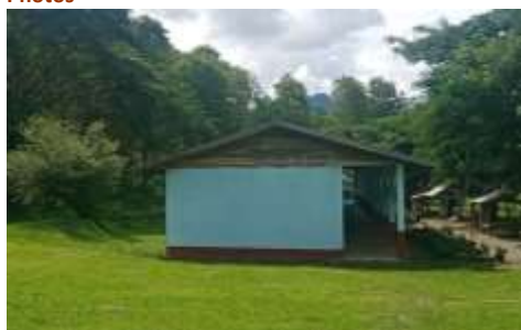
The construction was put on hold due to a lack of funding. We will support Sathan Primary School by completing the unfinished school building.