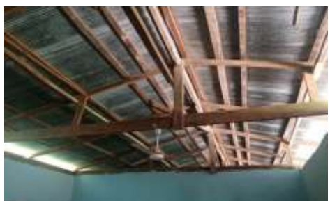
The rainwater seeps through nail holes causing serious damage to the roof trusses.