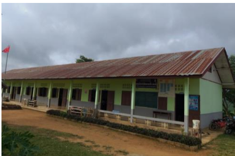
The five classroom building with damaged roof and ceiling