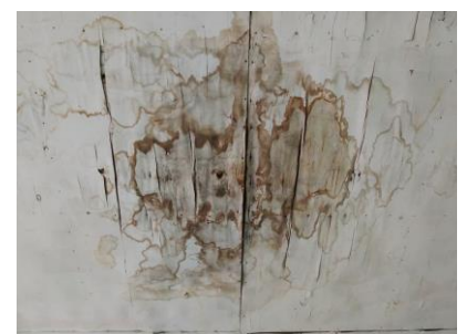
Rainwater leakage induced damage in the ceiling