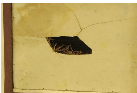
Bird nests in a hole in the ceiling