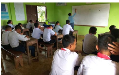
Secondary students attending class in one of the classrooms