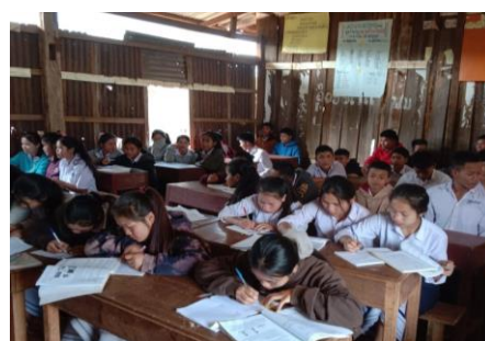
The classrooms are packed, noisy and unsafe