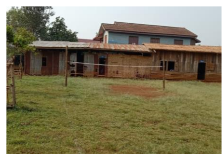
A rotten barn is no place for children to prosper