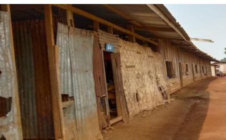
The old primary school close to its break down