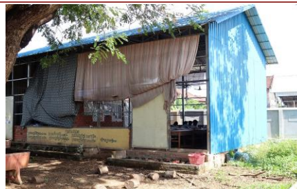
Heat, rain, dust and noise easily enter an exposed classroom