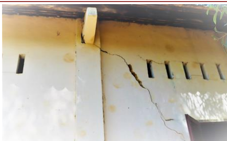
One of the many indicators of poor structural integrity. The building might collapse soon.