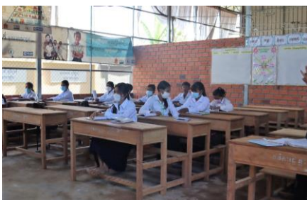
Students must be free from external distractions with proper classroom walls in order to focus and thrive