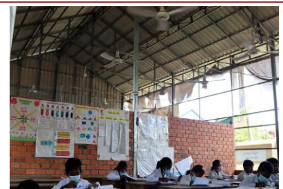
Students lose focus without a proper dividing wall between classrooms