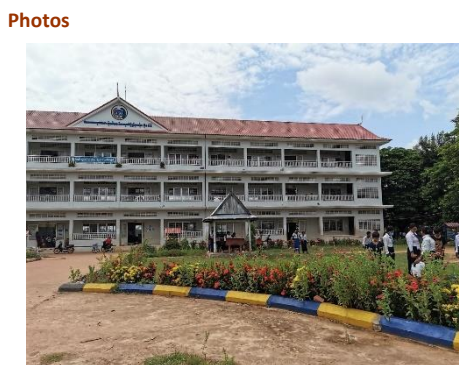
The secondary school is in good condition, well managed and ready for a computer lab

Implementation We support the school's project by renovating an existing classroom into a computer lab equipped with 31 desktop computers. We will additionally provide 31 headsets, 1 printer, 1 LCD projector, 2 air conditioning units as well as appropriate furniture. These reinforcements will encourage and drive high-quality, sustainable computer classes for the students in grades 10 through 12. The funding also includes ongoing training for the computer teachers. The long-term impact of this project is quite expansive as basic computer knowledge is indispensable in today's labour market and also opens the doors of great opportunity. In addition, the new computer lab will improve the students' learning environment and increase their motivation as they witness the practical and useful applications of their education. The school will be responsible for arranging the purchase and installation of the new equipment, but we will offer support to ensure that the equipment is of high quality and that installation is carried out correctly. The students will contribute USD 0.25 per month to support the upkeep of the facilities, as agreed with the parents. We consider this a low-risk project. The school is located just off a main road, making it easily accessible during all seasons. The initial set-up begins in August 2022 and it is expected to be completed by November 2022.