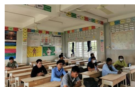
An existing classroom will be renovated to become the new computer laboratory