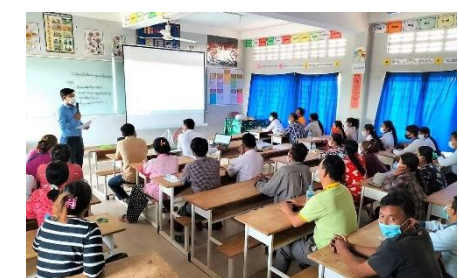
Child's Dream staff meet with school officials to discuss the project

Implementation We support the school's project by renovating an existing classroom into a computer lab equipped with 31 desktop computers. We will additionally provide 31 headsets, 1 printer, 1 LCD projector, 2 air conditioning units as well as appropriate furniture. These reinforcements will encourage and drive high-quality, sustainable computer classes for the students in grades 10 through 12. The funding also includes ongoing training for the computer teachers. The long-term impact of this project is quite expansive as basic computer knowledge is indispensable in today's labour market and also opens the doors of great opportunity. In addition, the new computer lab will improve the students' learning environment and increase their motivation as they witness the practical and useful applications of their education. The school will be responsible for arranging the purchase and installation of the new equipment, but we will offer support to ensure that the equipment is of high quality and that installation is carried out correctly. The students will contribute USD 0.25 per month to support the upkeep of the facilities, as agreed with the parents. We consider this a low-risk project. The school is located just off a main road, making it easily accessible during all seasons. The initial set-up begins in August 2022 and it is expected to be completed by November 2022.