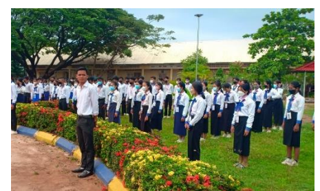
The students are eager to learn and will greatly benefit from a computer lab programme