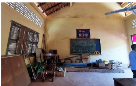
An existing classroom will be renovated into the new computer laboratory