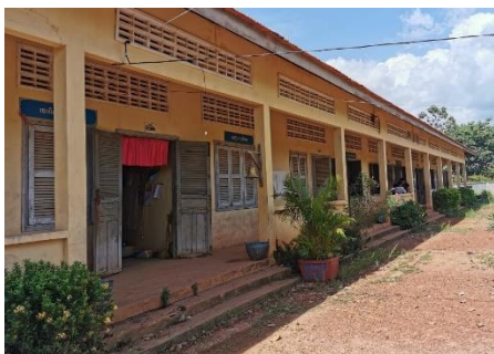
The school is ready for a computer laboratory