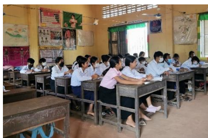
The students are eager to learn and will greatly benefit from a computer lab programme