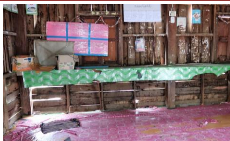
Rotten wood and poor structural integrity of the building is grave danger for students and teachers