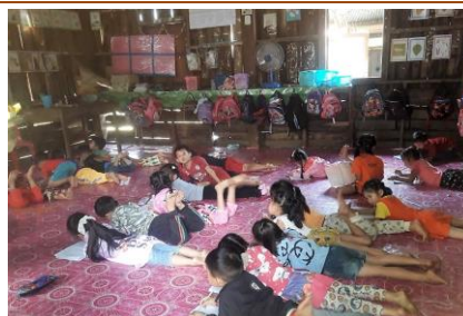
A nurturing, safe and comfortable classroom environment is essential for early childhood and student development