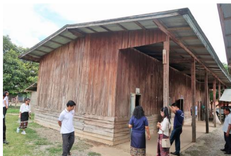
The old, run down nursery school building is in dire need of replacement