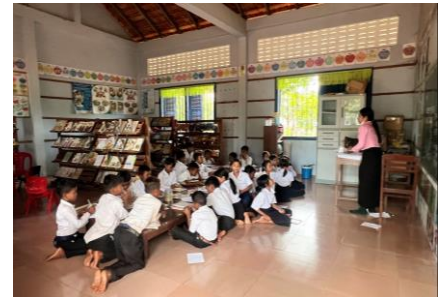
Students thrive in a safe and conducive learning environment