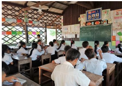
Classes are becoming overcrowded with more space needed to support student growth