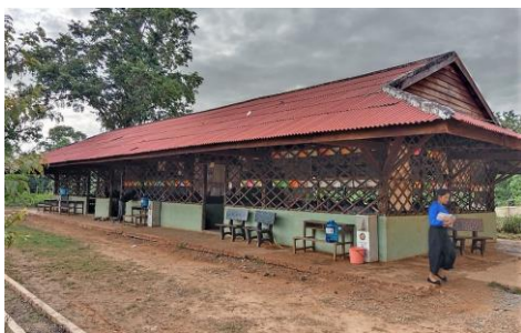
The old building will be replaced with a new school building with four classrooms