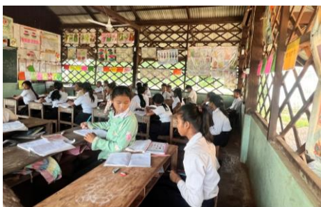
Without proper walls, outside elements freely enter the classrooms creating distractions for students