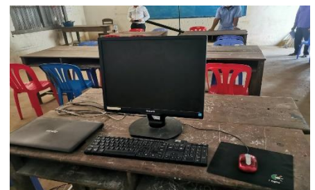
The school currently only has a very few working computers