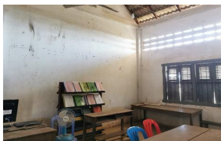
An existing classroom will be renovated to become the new computer laboratory