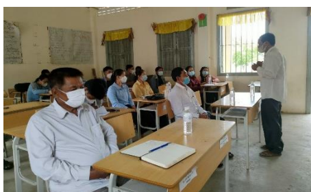
Child's Dream staff meet with school officials to discuss the project