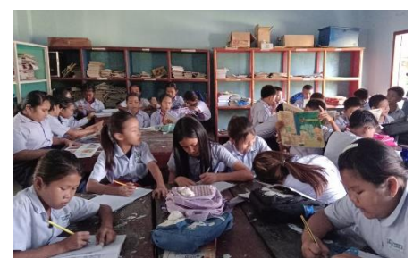
The current classrooms have become overly crowded contributing to a chaotic learning environment