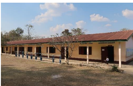
Only one building of Fangdang Primary School remains in good condition