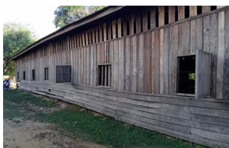
After two decades of heavy use and exposure to harsh Laotian climate, the school building housing five classrooms, made of dry rotten woods and metal sheet roof, is in need of replacement