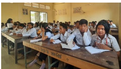
However, classrooms have become increasingly overcrowded