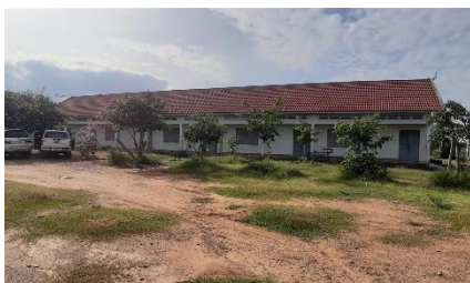
The current school building, containing five classrooms, is still in decent shape