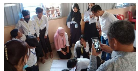
The students can't wait to have more space to comfortably study!