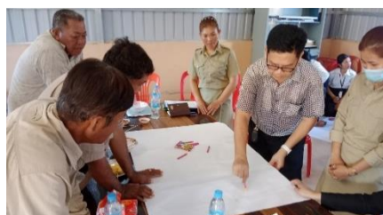
Teachers and community members give input into the desired new school building plan