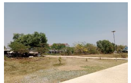
The new boarding house will be built on this open space on the school grounds