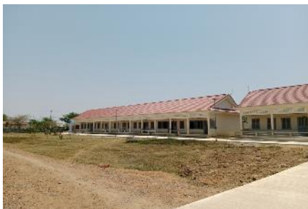
Bavel High School serves students from 49 villages