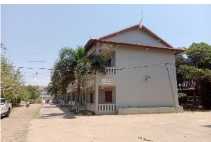
The school grounds are in good condition and the students receive a good education; however, those from faraway village face the burden of looking for suitable accommodation nearby the school