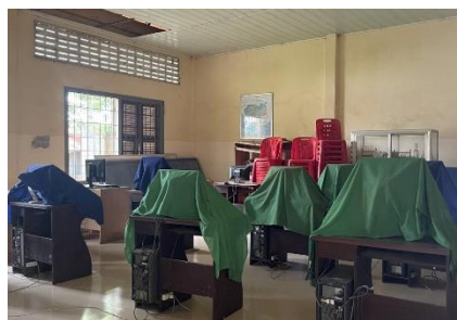
However, the existing computer laboratory is outdated and the computers no longer work