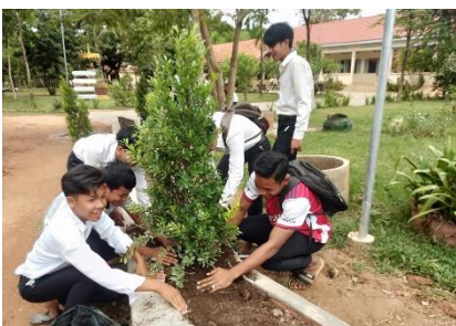
The school environment and school buildings are all in good condition