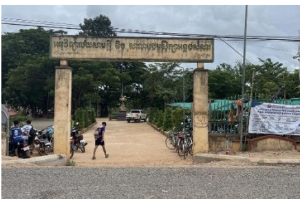
Samki High School is in reasonable condition, but lacks a functional computer laboratory