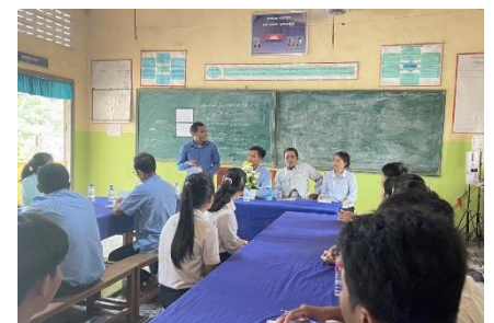
Child's Dream staff meet with the school's management to discuss the project