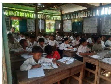
The students currently study in very cramped conditions