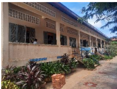
One of the two buildings of Wat Sdei Primary School