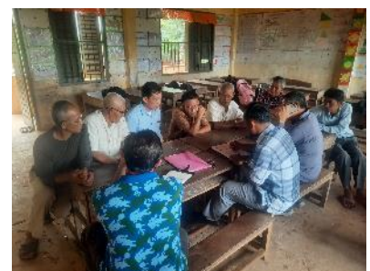
Our team meet with school management and community members to discuss the project