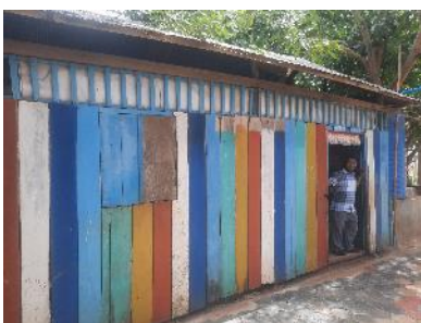
This one-room building is safe to use, but is too small to fit the growing student population