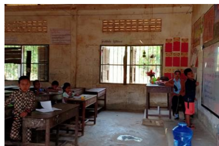
The classrooms, with cracked and rotten walls and floors, are quickly deteriorating and pose a serious safety threat