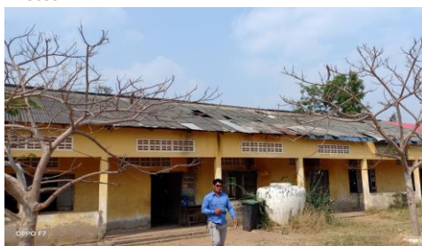
The old and dilapidated cement building is in dire need of replacement