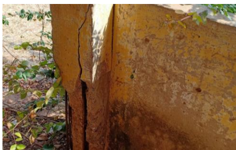
The building is structurally unsafe, with cracked walls and pillars