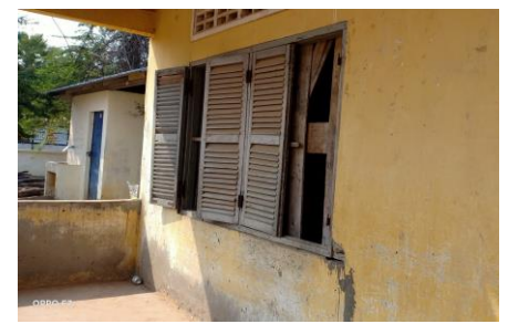
The wood on the building is rotten and falling apart