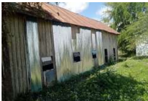
The makeshift school building has zinc sheets patching the walls