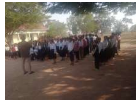
The students need a safe learning environment with space for everyone