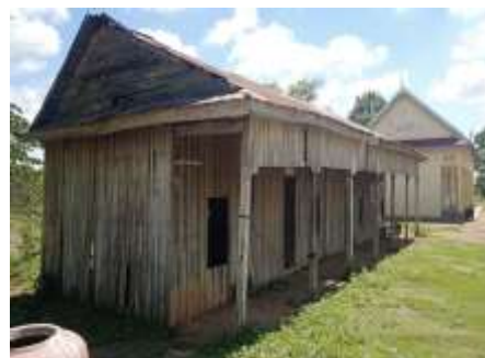
The school building to be replaced will be near its probable collapse