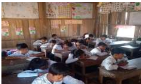
Children studying in a dark and unstable classroom