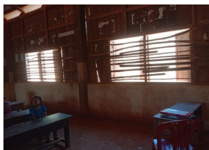
The building has seen much better days