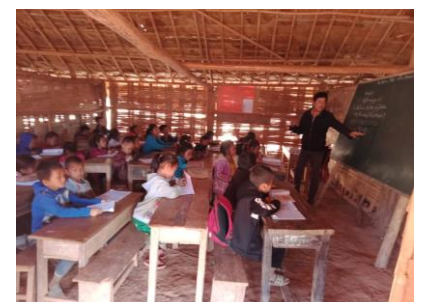
Very cramped learning conditions