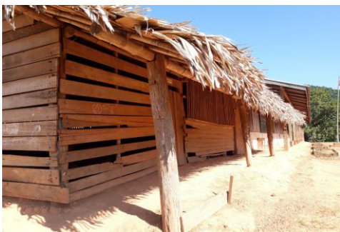
The current school constructed of half wood and half cement