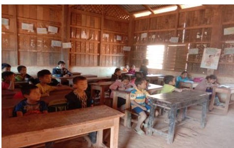
Students attending a class