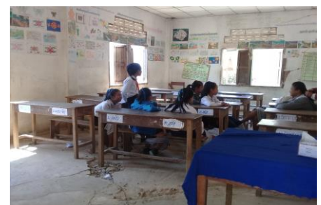
Students at the school need a safe and motivating learning environment