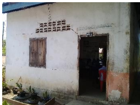
One of the classrooms in the unsafe building