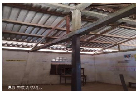
This room was deemed unsafe and was consequently vacated