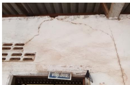
There are large cracks throughout the building