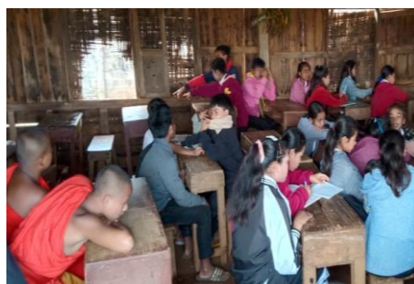
Large cracks in the wall serve as windows.