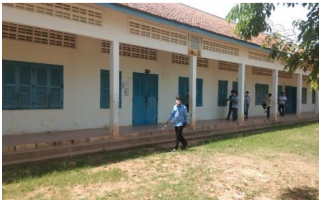
Thlok Secondary School already has one building, which is in good condition