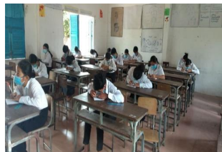
The students enrolled at Thlok come from four local, surrounding primary schools