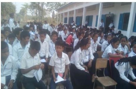
The increasing student population means there is urgent need for more classrooms