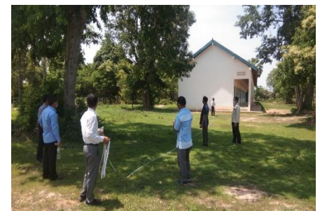
Child's Dream staff meet with the school management to assess the vacant space for the new building