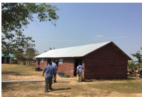
The wooden, rotten old building