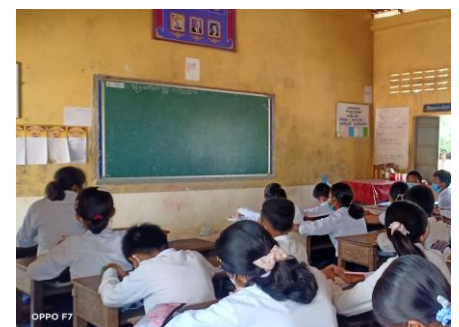
A class at Wat Chikreng School taking place in the still good building