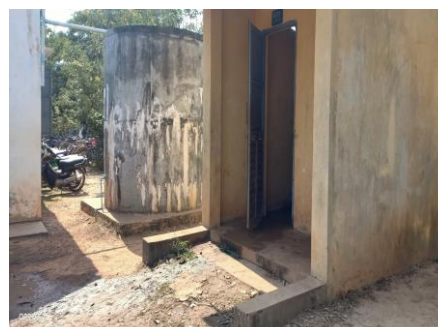
The old toilet