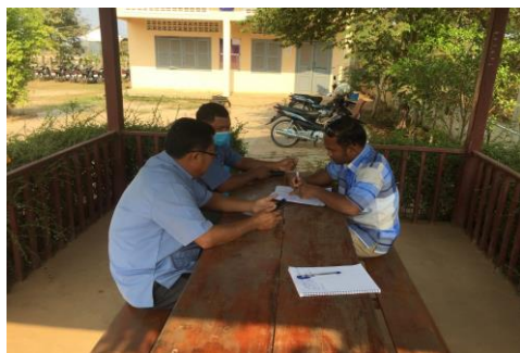
Discussing the project with community members